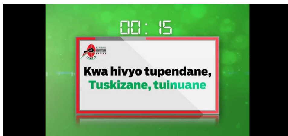
Screenshot of video animation